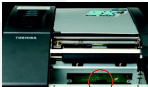
▲ UHF RFID antenna